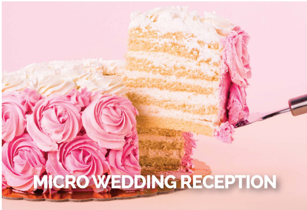
MICRO WEDDING RECEPTION